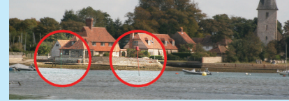
Bosham Channel Markers