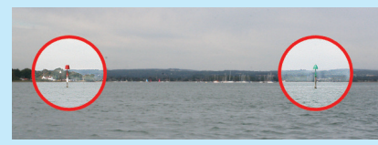
The Thorney Channel 'Goalposts'

'Goalposts' mark the safely navigable gap in the potentially hazardous run of 'dragon's teeth' across the Channel - similarly, the Bosham Channel Markers to the north of Bosham quay. For the purposes of our races, they are marks of the course, and boats must pass between them whenever the course requires south-to-north/north-to-south passage along Thorney and/or Bosham Channels.